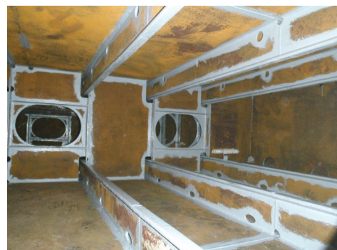
RS 500P stripe coat applied in a potable water tank