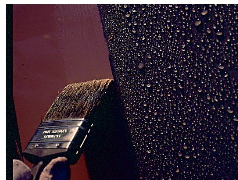
Applying RS 500P on a wet & sweating substrate